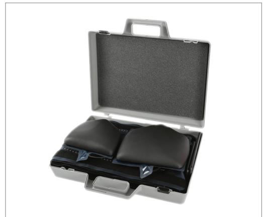
Dedicated case for convenient handling and storage across diverse clinical environments, including MR environments