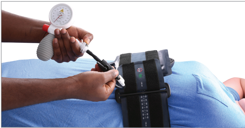
Shutoff valve and quick disconnect pump provide secure method of sealing air inside the bladder to enable consistent pressure