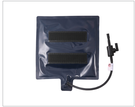
Bladder is designed to be durable up to 250 mmHg, a 2x factor of safety