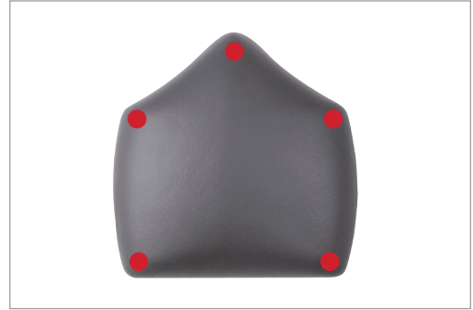
Fiducial markers aid in consistent patient setup relative to patient anatomy