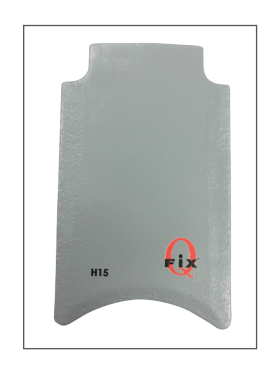
15 mm headrest